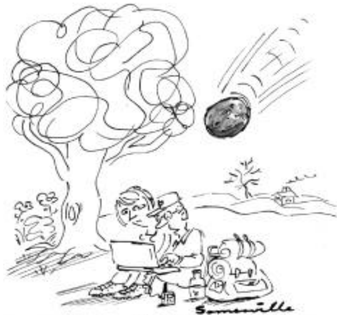
"According to this Global Positioning System, we're in the wrong place at the wrong time."

She also heard information from other Johnson Space Center employees that some astronauts had seen extraterrestrial craft, and that when some of them wanted to speak out about this they were threatened.